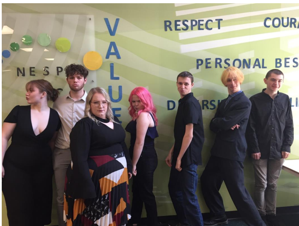
Informal Formal attendees giving their best pose while dressed to impress!

Congratulations to our nine students that completed their SACE in 2020!